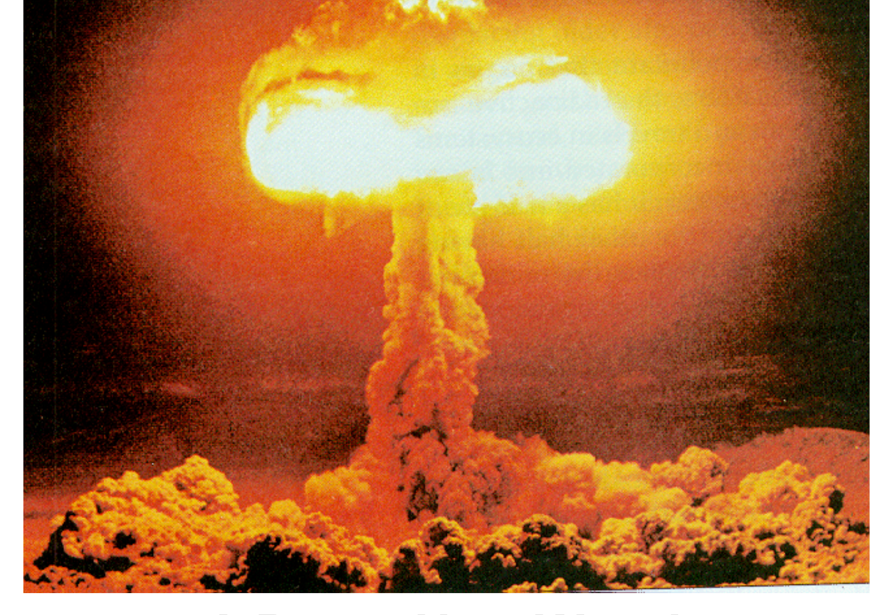
A Brave New World