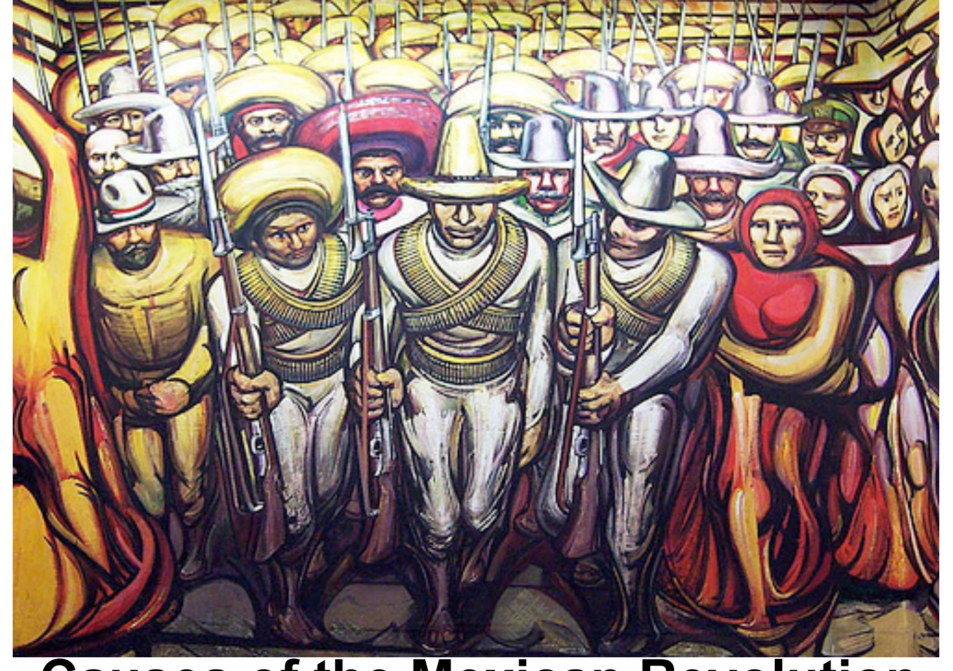
Causes of the Mexican Revolution