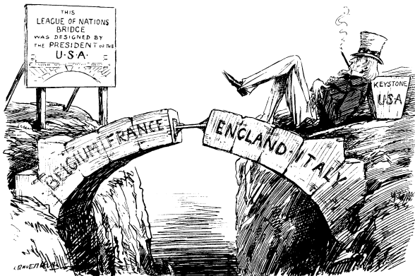
THE GAP IN THE BRIDGE.